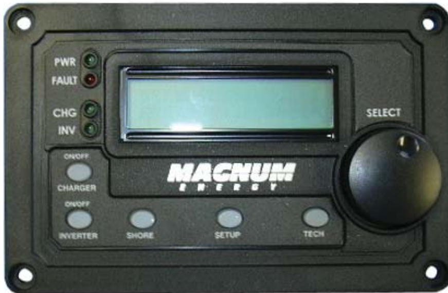
Figure 1, ME-RB Remote Control

Info: For information on installing, operating and troubleshooting the ME-RB, refer to these sections in the ME-RC Owner's Manual.